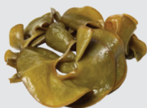
Seasol Liquid Seaweed extract

Seasol Plus is a unique blend of Seasol with added Fish, and Humate. It is a bio-positive material providing a balance of animal and plant derived compounds. Improves soil structure and soil microbial activity, stimulates root growth and increases flowering. Aids plant establishment and reduces transplant shock, provides essential trace elements for plant health.