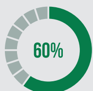
Seasol Liquid Seaweed extract

Trilogy 631 is a unique blend of three refined natural soil & plant beneficial compounds. Seasol (Kelp), PowerFish (Fish extract) and Organic* Humate. Trilogy 631 enhances plant and root growth, supplying the soil carbon and nitrogen cycle, supplying plants with amino acids, leaves the soil with Soil Organic* Matter, and converting more sunlight.