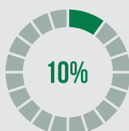
Liquid Humate extract

Each of the extracts have ingredients for specific roles: